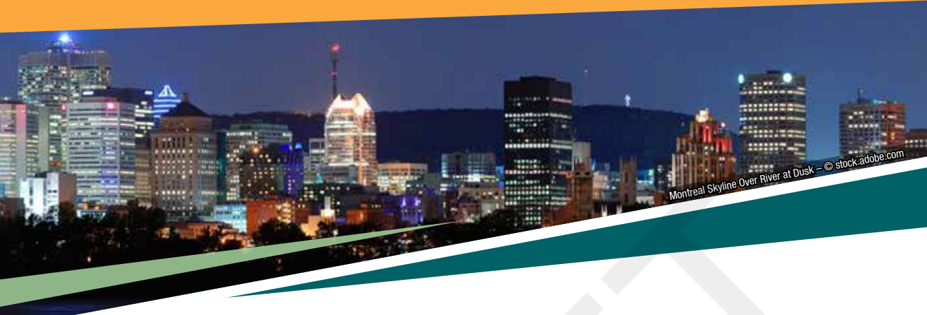
Montreal Skyline Over River at Dusk