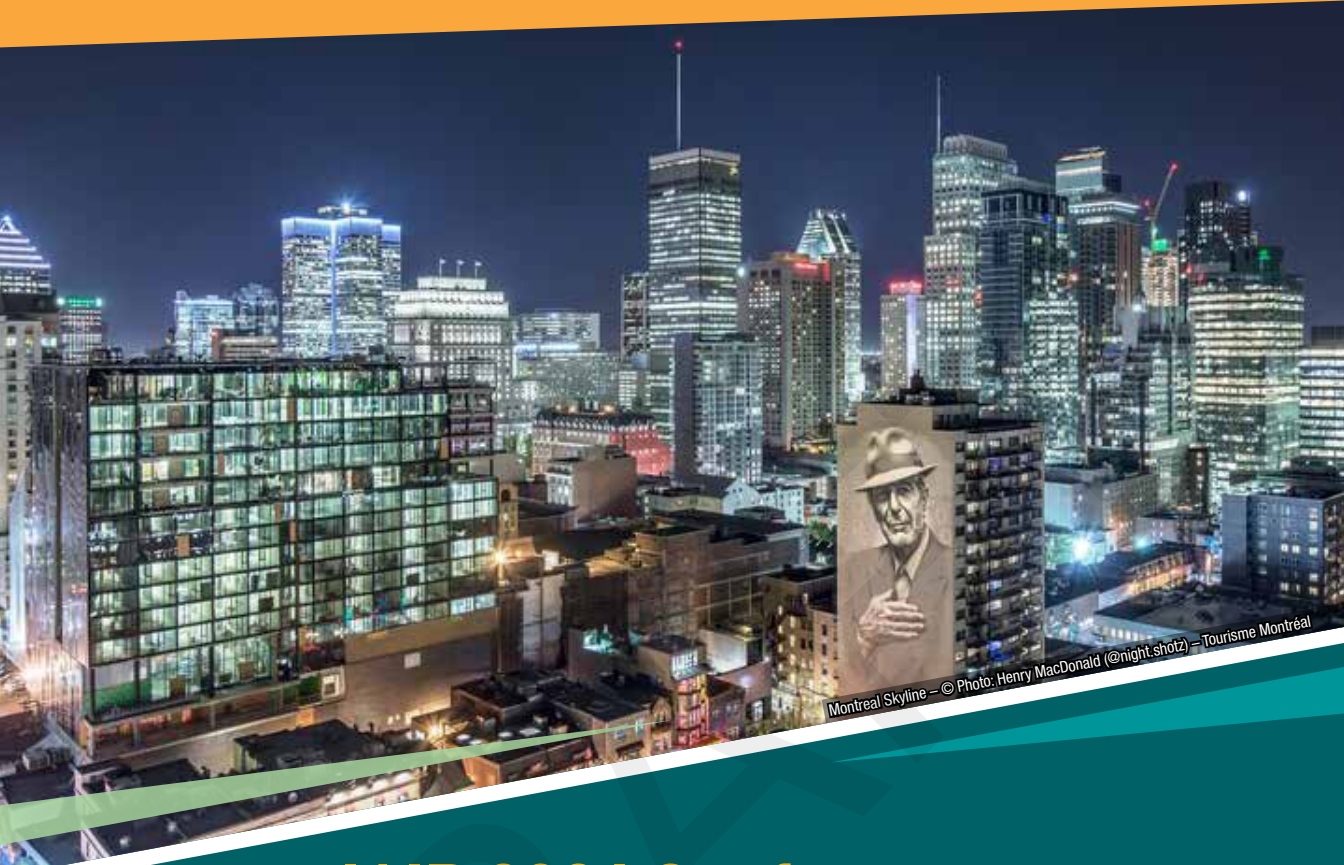
Montreal Skyline