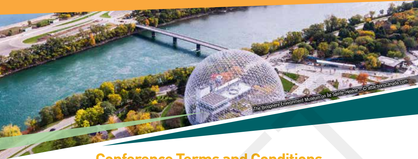
The Biosphere Environment Museum on Île Sainte-Hélène